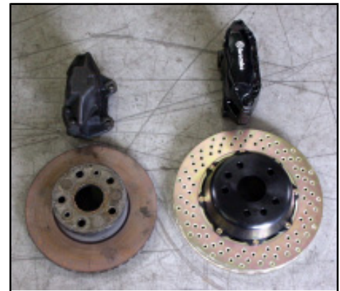
308 Brembo GT brake vs stock